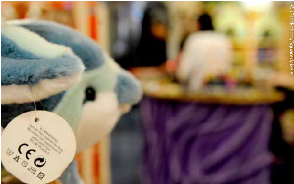
EU single market directives establish EU-wide product safety and environmental requirements.

given the financial crisis. The new rules bring simplified procedures, greater flexibility and have been adapted to better serve other public sector policies and allow for the best value for money. This will make public procurement more efficient and strategic, whilst respecting the principles of transparency and competition to the benefit of both consumers and economic operators. Concessions are partnerships between the public sector and mostly private companies, where the latter exclusively operate, maintain and carry out the development of infrastructure or provide services of general interest. Concession contracts underpin an important share of the economic activity in the EU. The new rules are designed to make it easier to conclude concessions and therefore public-private partnerships, encouraging new investments, promoting a quicker return to sustainable economic growth and contributing to innovation and long-term structural development of infrastructures and services.