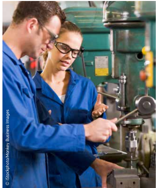
European industry is more competitive when companies can sell their products all over the single market.

Businesses seeking to provide services in more than one EU member country can also get information about relevant procedures and requirements through so-called points of single contact — single entry points they can access electronically either at home or in another EU country. European entrepreneurs, meanwhile, can get a wide range of free business support, including expert advice on EU single market legislation from patents to taxation issues, from the Enterprise Europe Network , which has close to 600 member organisations in 50 countries.