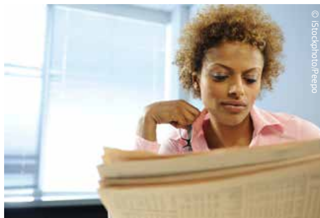
Europe needs new enterprises.

In the past few years a number of concrete measures have been adopted that have gone a long way to improving the way the European single market works. But despite this, there are still a number of gaps to be closed in the single market, mainly in the areas of services, digital and energy. These require in some cases an action at EU level in order to further remove administrative barriers and help individuals and companies make the most of the single market. The single market gaps can already be tackled through the correct implementation of the existing legislation by the Member States. The Commission is increasingly promoting the idea of partnerships with and between Member States, including peer reviews and sharing best practices. Looking forward, the European single market needs to be further developed in order to exploit its untapped potential as an engine for growth.